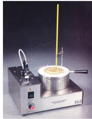
Cleveland Open-Cup apparatus