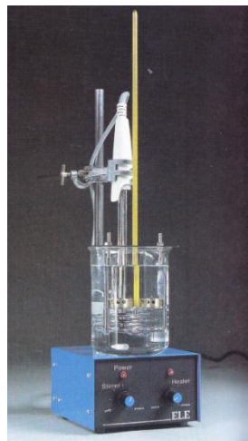
Ring & Ball apparatus (Softening Point Test)