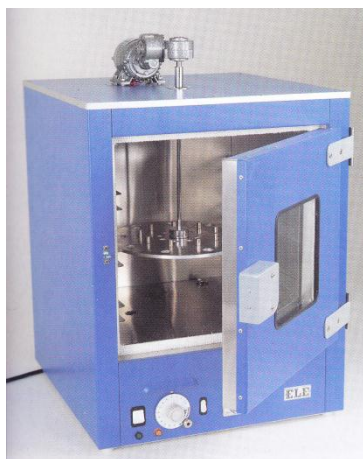
Oven (Loss on heating )